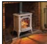
Cast Iron Gas Stoves