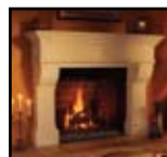
Direct Vent Fireplaces