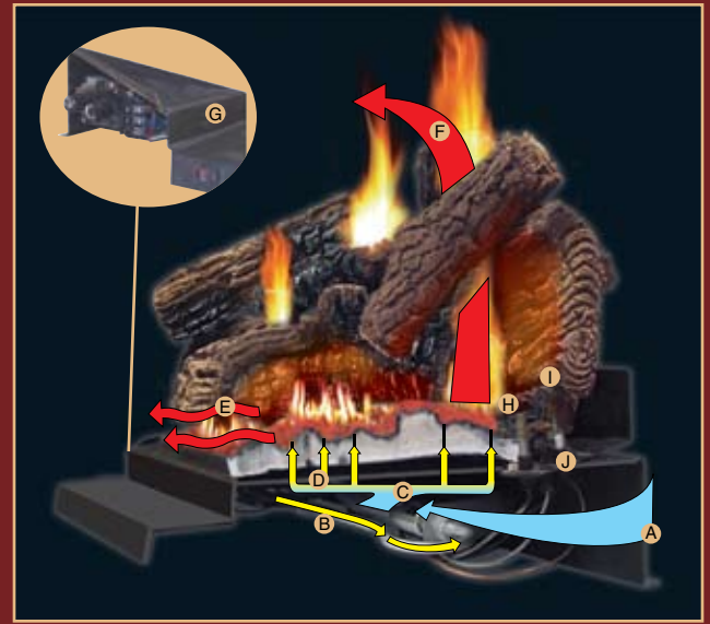
30" vented series providing up to 65,000 BTU's with advanced radiant infrared heat technology.