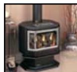
High Efficiency Gas Stoves