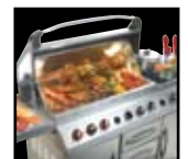
Gourmet Gas Grills

Consult your owner's manual for complete installation instructions and proper clearances to combustible materials. Check all local and national building codes and gas regulations. All specifications are subject to change without prior notice due to on-going product improvements. Products may not be exactly as shown. Napoleon® is a registered trademark of Wolf Steel Ltd. Patent U.S. 5.307.801, 75054-Can. 2.073.411, 2.082.915, 74589 © Wolf Steel Ltd. Patents Pending.