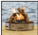
Outdoor Living Products